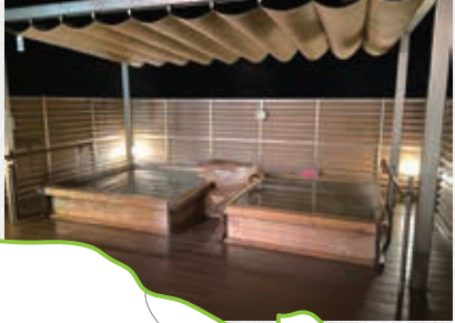
Western-style Shogai seishun-no-yu

The large Western-style bath, Shogai seishun-no-yu, and the Japanese-style bath, Bijin-no-yu, alternate daily between the men's and women's baths.