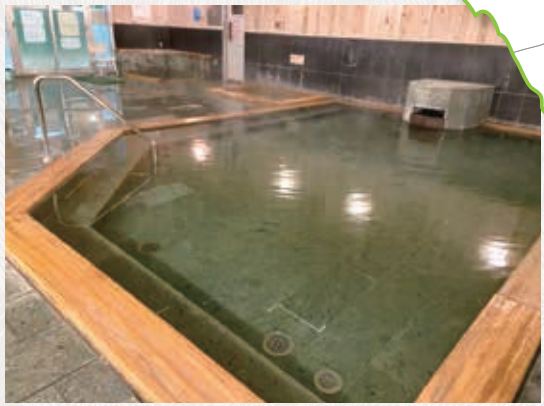
Japanese-style indoor bath

Tama is known for lush greenery, mountains, and breathtaking nature! It's a popular destination for leisure, filled with majestic mountains, beautiful landscapes, and abundant greenery.