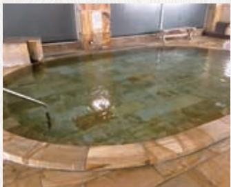
Western-style indoor bath

After a day out, soak in the hot spring and enjoy a refreshing time for both your body and mind.